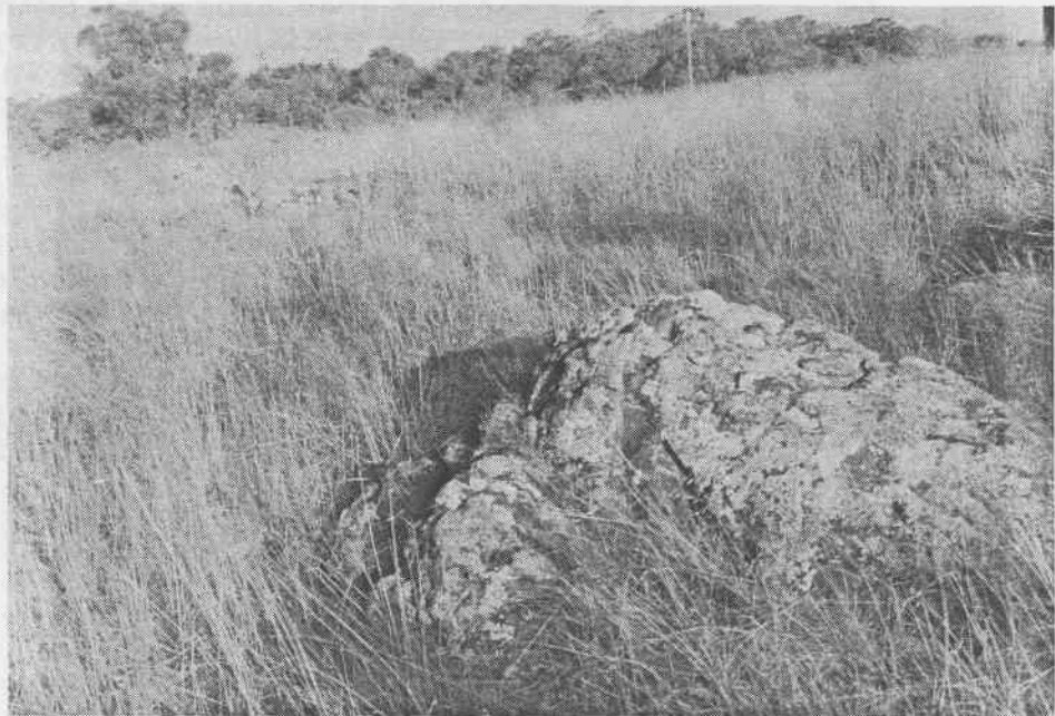
PLATE 48: Gossan outcrops, Gossan Hill.

SITE NUMBER: B 10 SITE NAME: GOSSAN HILL LOCATION: Map 200606 GR 206600-607600 Ridge and hill slopes south of College Street, Bruce, opposite Canberra CAE (Figure 24) MAP CODE: 208600/4 SIGNIFICANCE TYPE: Geological SIGNIFICANCE RATING: Regional ACCESS: College Street TENURE: Portions of Blocks 9 and 13, Section 4, Bruce. CURRENT PROTECTION STATUS: Listed on Register of National Estate (Australian Heritage Commission)