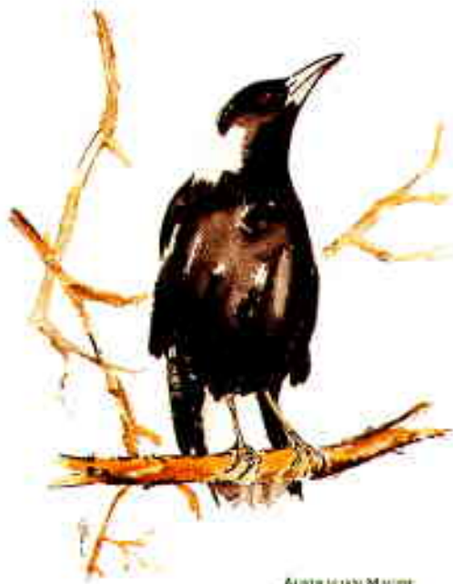
AUSTRALIAN MAGPIE Gymnorhina tibicen