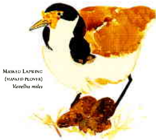
MASKED LAPWING (MASKED PLOVER) Vanellus miles

c the fescue is a high endophyte variety which is resistant to attack by the Argentine Stem Weevil which is a serious pest of cool season grasses.