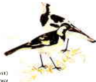
MAGPIELARK (PELWIT) Grallina cyanoleuca

The hedge surrounding the garden is Thuja plicata 'Zebrena' and the pergolas are covered with pink flowering wisteria. The yellow flowering 'Zonta' roses were a gift to the Parliament from Zonta International, a service club for professional and business women. Beneath the Formal Gardens is the loading dock. The path continues past the second orchard.