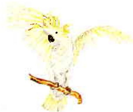
SULPHUR-CRESTED COCKATOO Cacatua galerita

16 The small low plants here are Grevillea iaspicula . This rare grevillea is found near Wee Jasper in New South Wales. These plants were propagated and planted by students from Red Hill Primary School.