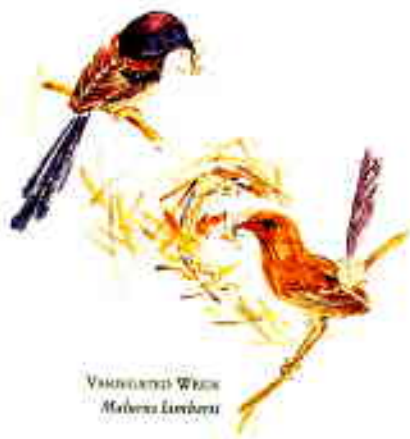
Variegated Whick Melospiza luteiventris

20 The pavement along the front of Parliament House, between point 20 and point 1 of the Landscape and Gardens Walk, gives excellent views of the northern grass ramps which reinforce the 'hill' nature of the design and allow public access over the building. The Forecourt, treeless and paved in stone and gravel, suggests in a simple sense the vastness of Australia's red desert interior and makes a symbolic link with the red gravel on Anzac Parade leading to the Australian War Memorial. Plantings of Grevillea poorinda 'Royal Mantle', chosen both for its low habit and leaf that closely resembles a eucalypt leaf, surround the central island Aboriginal Mosaic which forms part of the Ceremonial Pool. The compact ground cover plantings around the entrance of the Forecourt carpark are Juniperus sabina .