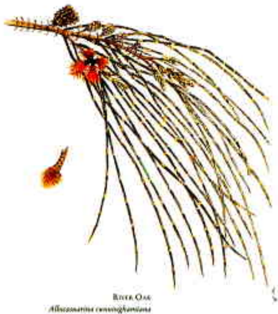
RIVER OAK Allocasuarina cunninghamiana

9 This area was the first section of landscape to be completed, so its size and density are well advanced in comparison with the rest of the gardens. There is a variety of plants in this area including she-oaks ( Casuarinas and Allocasuarina species), wattles ( Acacia species), grevilleas and callistemons. The cage structure is a golf practice net.