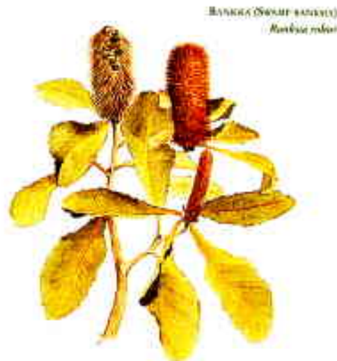
BANKSIA (SWAMP BANKSIA) Banksia robusta

7 From this point, several species of banksia can be seen. Banksia, a genus of the Proteaceae family, is named after botanist Sir Joseph Banks who travelled on the Endeavour with Captain James Cook in 1770. The banksia nearby is Banksia robusta . This is native to the swampy regions of New South Wales and Queensland and can reach a height of 3 metres. The flowers are blue-green in bud and yellow-green when open. They flower in spring and attract honey-eating birds.