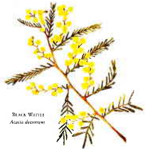
BLACK WATTLE Acacia decurrens

Please note that the ground can be heavy after rain.