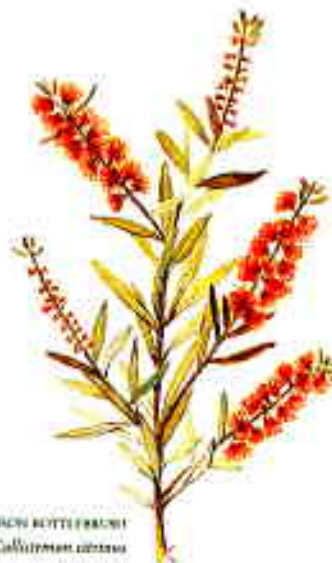
CHARLES SCRIVENER Callistemon ciliatus

3 The two exercise sites at this point are part of an eight station exercise course which is available for use by Members, Senators, Parliamentary Staff and visitors.