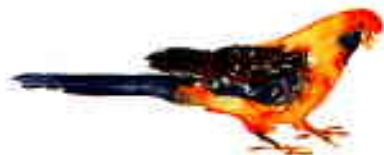
CRIMSON ROSELLA Platycercus elegans

We hope that you have enjoyed this stroll through the outer landscape of Parliament House.