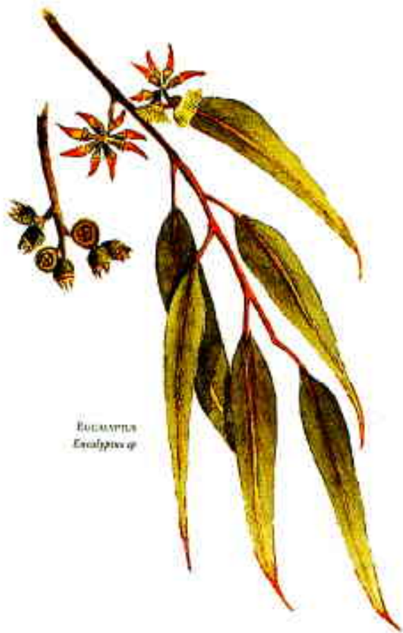
EUCALYPTUS Eucalyptus sp.

16 The small low plants here are Grevillea iaspicula . This rare grevillea is found near Wee Jasper in New South Wales. These plants were propagated and planted by students from Red Hill Primary School.